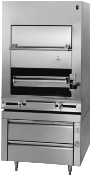
JMHB-36 shown with JRLH-02R-T-36