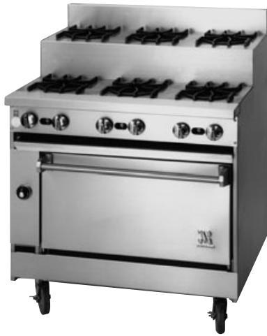
JBRE-3-3-36 with optional casters.