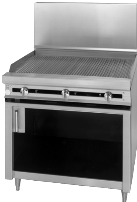
JTRH-36GG with stainless steel riser