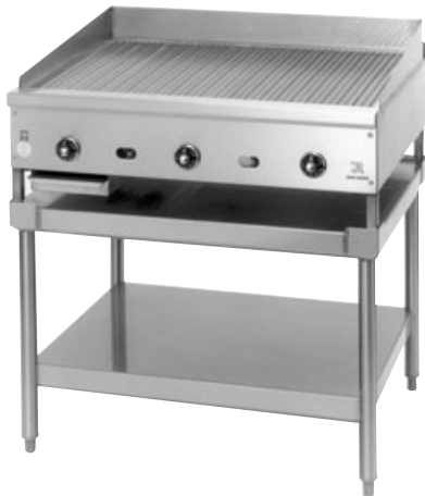
JGGT-2436 (shown with ST-36)