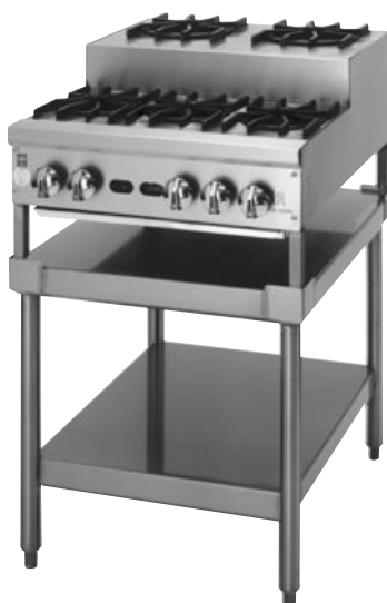
JHPE-218 shown with ST-24