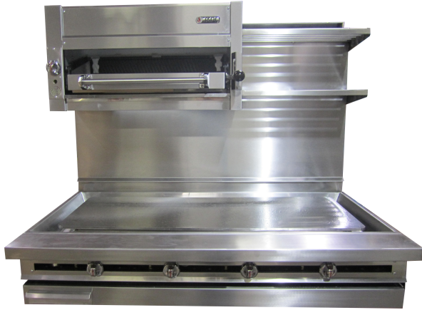
JTRH-60IP (shown w/range mounted salamander and a double deck tubular shelf)