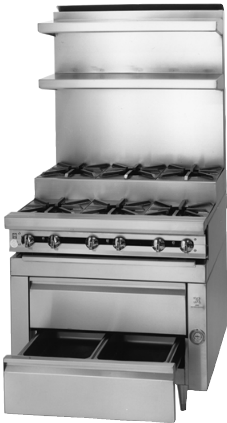
JMRHE-3-3 with double high shelf and mounted on JRLH-02R-T-36