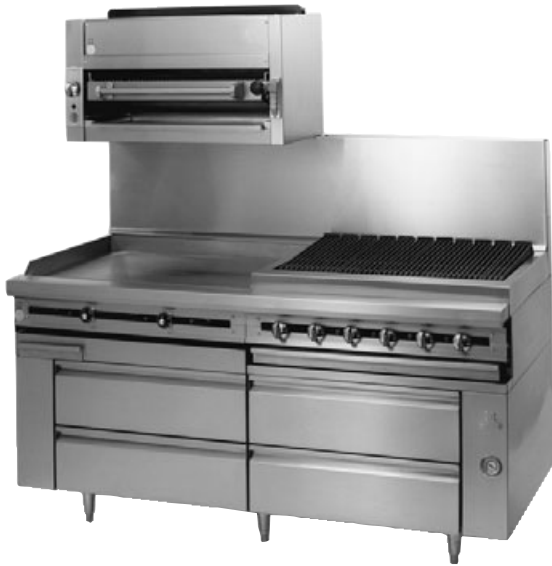
JRLH-02R-T-36 shown with JSB-36RM, JMRH-36GT, JMRH-36B