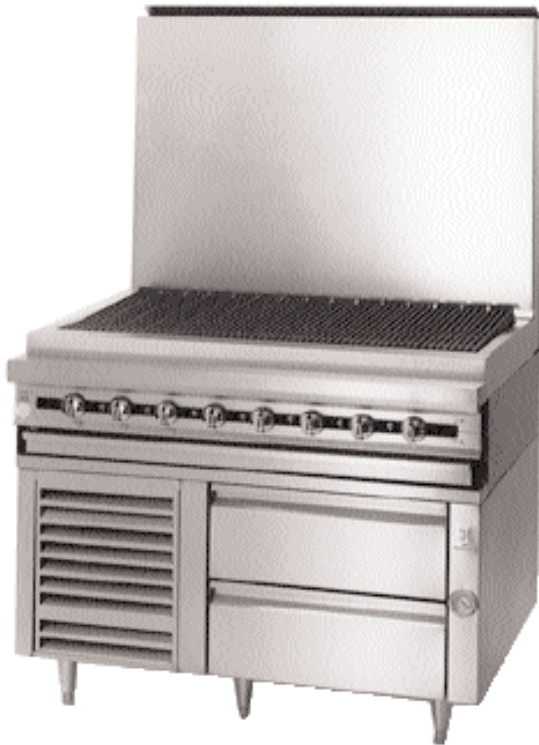
JRLH-02S-T-48 shown with JMRH-48B