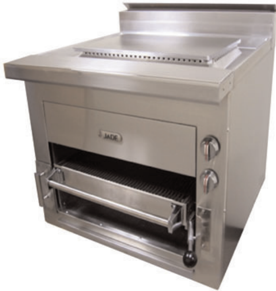
Radiant style - JMHR-36P (shown without legs)