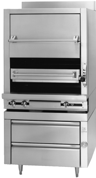
JMHBR-36H with JRLH-02R-T-36