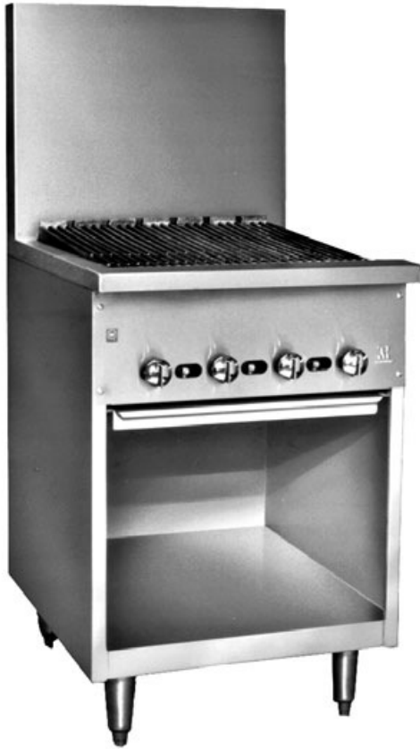
JSR-24B with optional high riser