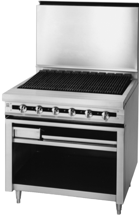
JTRH-36B shown with optional high riser