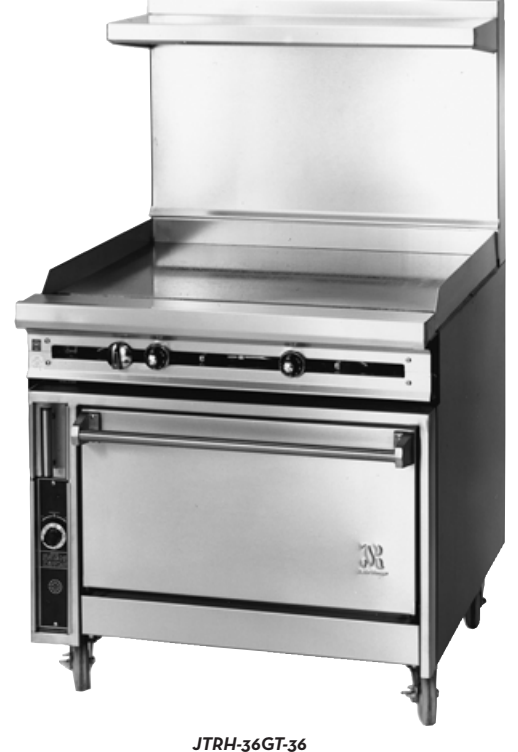
with optional high shelf and casters