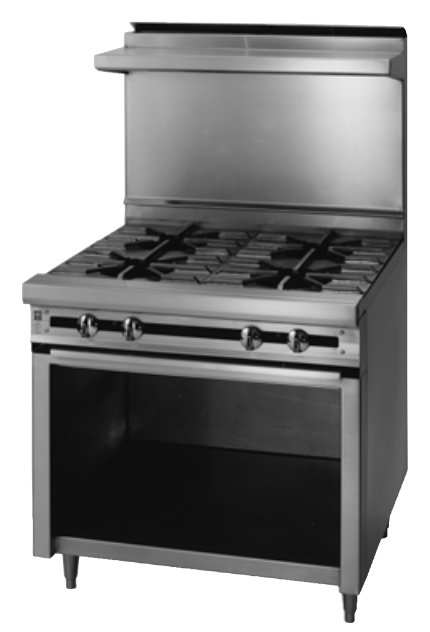
JTRH-4 with optional high shelf