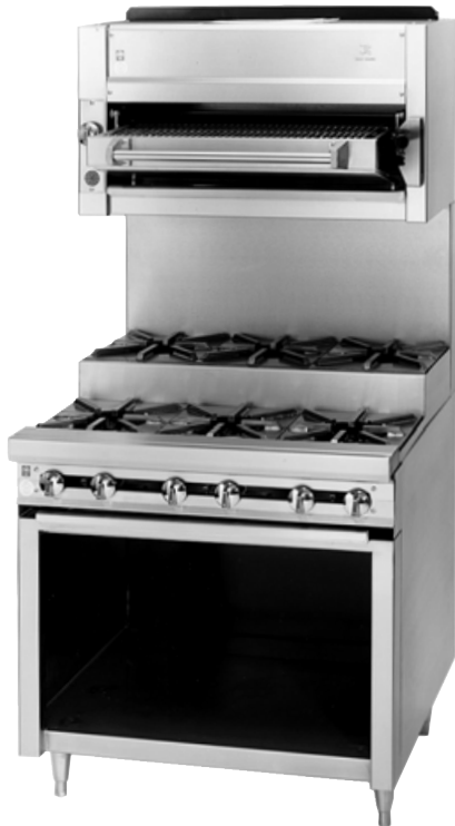
JTRHE-3-3 with JSB-36RM range mounted salamander