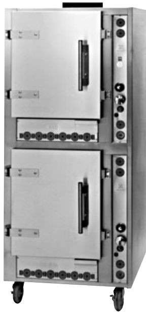
MDL-250 shown with optional stainless steel sides and casters