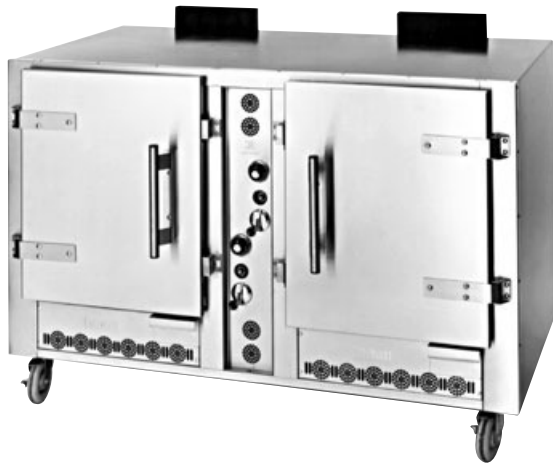
MDL-100 shown with optional casters